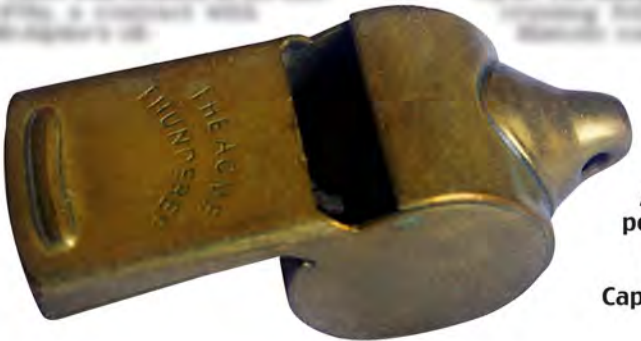
A most prized possession: The brass whistle belonging to Captain Fegen VC

[Faded text column on the far right side of the page]