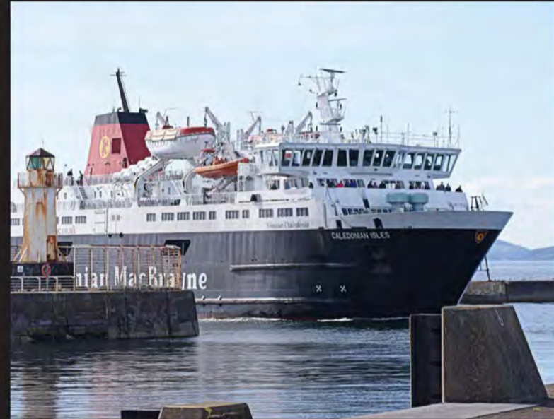
Challenging: CalMac's Caledonian Isles enters Ardrossan harbour; above. Right: The Waverley paddle steamer near Dumbarton Rock